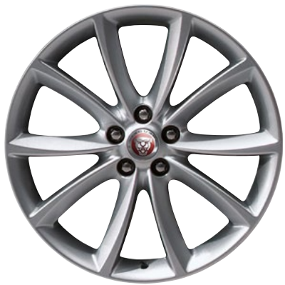
19" Style 1023, 10 spoke